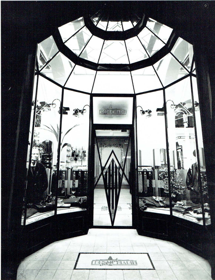
Eredi Chiarini Royal Firenze Eredi Chiarini Royal Florence

Born in 1947, graduated in architecture in Florence where he lives and works. Since 1973 he has been concerned with interior, architectural and product design.